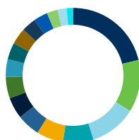
Sector mix (%)