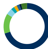
Country mix (%)